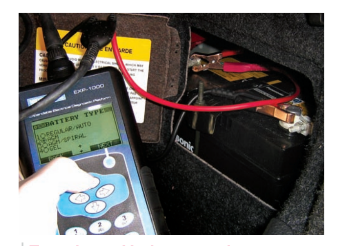
Test the 12V glass mat battery using an internal resistance tester such as the Midtronics EXP-1000 or EXP-1200.

The 12V battery should be tested at least every 15,000 miles. The 12V battery has no role in "cranking" the ICE, so there will not be the typical slow cranking associated with a weak battery. Because of this, owners usually do not notice a bad 12V battery until the car suddenly fails to start.